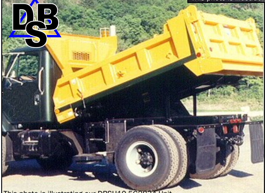
This photo is illustrating our DBSH10.5G2834 Unit